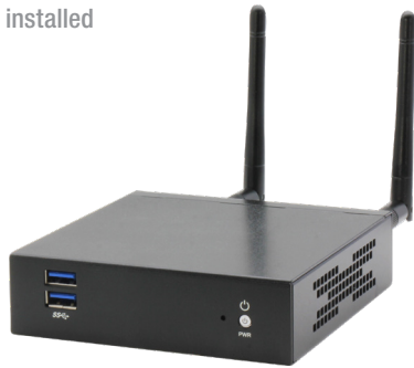
(Antennas: Optional Accessories)