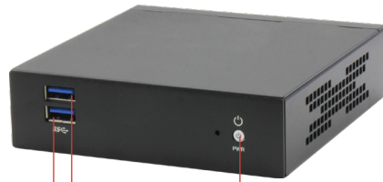
USB 3.2 Gen 1 x2