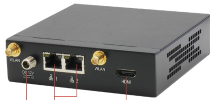
12V DC jack